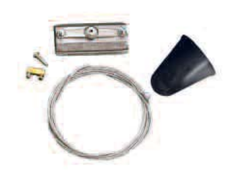
EL-009 WIRE SUSPENSION KIT ONLY BLACK